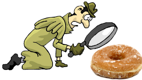
Figure 2: The major piece of evidence for today's unsolved crime streak

Today is your day. Your task is to implement a new agent that looks for the records in the database that bear a strong resemblance to the given signature of a dropped donut found at a new crime scene.